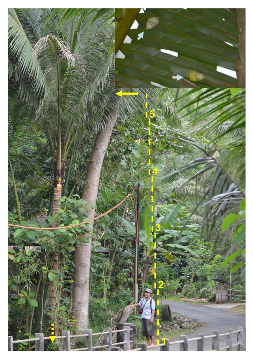
Figure 3 . Estimation of the height of the snail A. perversus using observer's height as comparison. Inset: zoom of the snails.

comfortable temperature and humidity just under the tree canopy (Moreno-Rueda et al. 2009). Like the other tree snail, Amphidromus is known to feed on microscopic flora such as fungal mats, lichens, or algal epiphytes which are grown on the tree trunks (Lok & Tan 2008). Amphidromus also known as a prey of rodents and bird (Kitt et al. 2014<sup>b</sup>). They could escape from their predator by climbing and hide between the canopy. A few broken shell were found in the location, however, there was