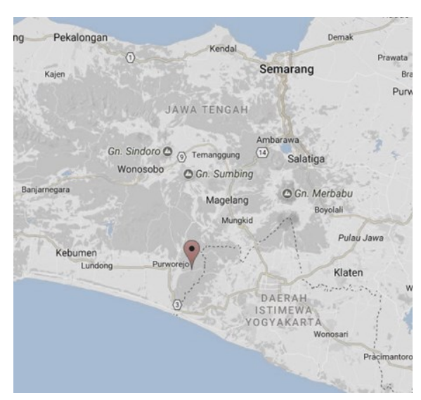
Figure 1 . Map of the location of Kaligono village.

177 m a.s.l., S07°44'10.73"- S07°44'11.75" and E110°05'14.72"-E110°05'17.56". Kaligono is located in Kaligesing district, Purworejo regency, Central Java province. Purworejo is located on the west side of Yogyakarta. Normally, April is in the dry season. However, during this field trip the rain often falls late in the afternoon.