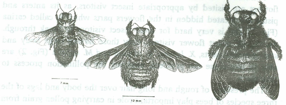
Figure 2. The large bees Crotallaria pollinators

Anoplolepis longipes, Megachile opposita and Formicidae (1 species). Pollination of flowers in C. urasamoensis can occur when the sited by appropriate insect visitors, as /its anters and