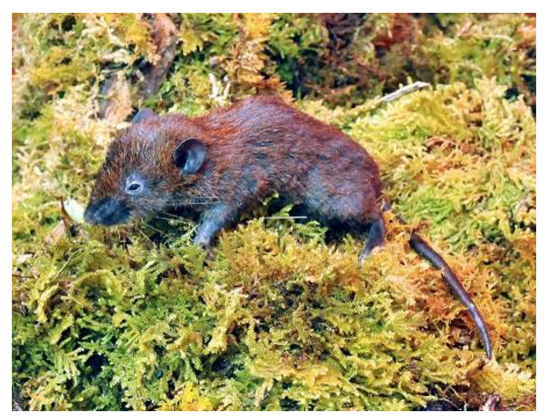
Figure 5. Crunomys celebensis (MZB34943) from Gunung Gandangdewata.