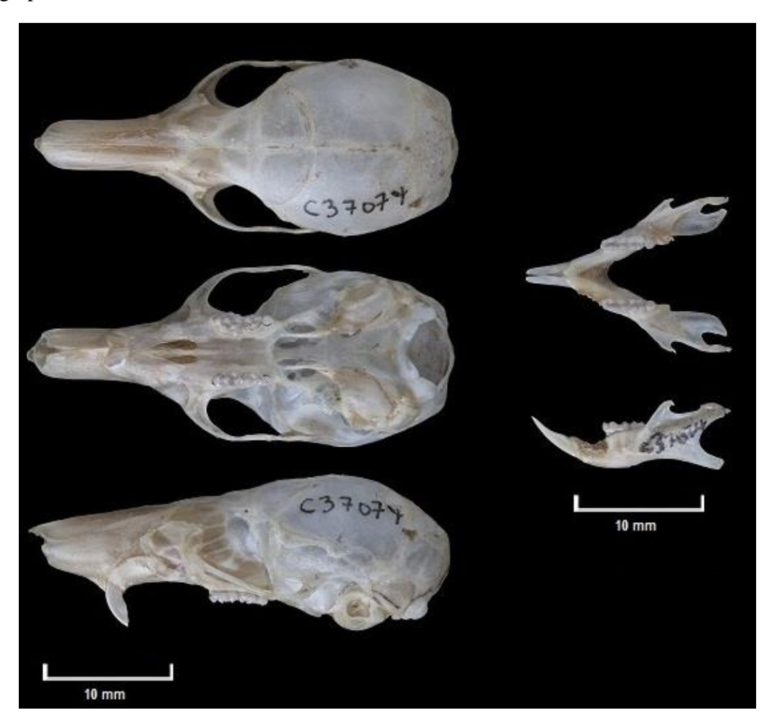
Figure 2. Sommeromys macrorhinos, NMV-C37074.

Crunomys celebensis is a terrestrial forest rat with a short and broad head, a stocky body, dark brownish chestnut pelage, small ears, short legs, narrow hind feet, and short tail. It is known only from three specimens taken in the vicinity of Danau Lindu in the northwestern portion of Sulawesi's central core. Neither S. macrorhinos nor C. celebensis have been collected since the 1970s (Musser 1982, Musser & Durden 2002). The habitat at the type locality of C. celebensis is tropical lowland evergreen rainforest. Here we report the first new records of these two species since their discovery and discuss the implications for their geographical, elevational, and habitat distributions.