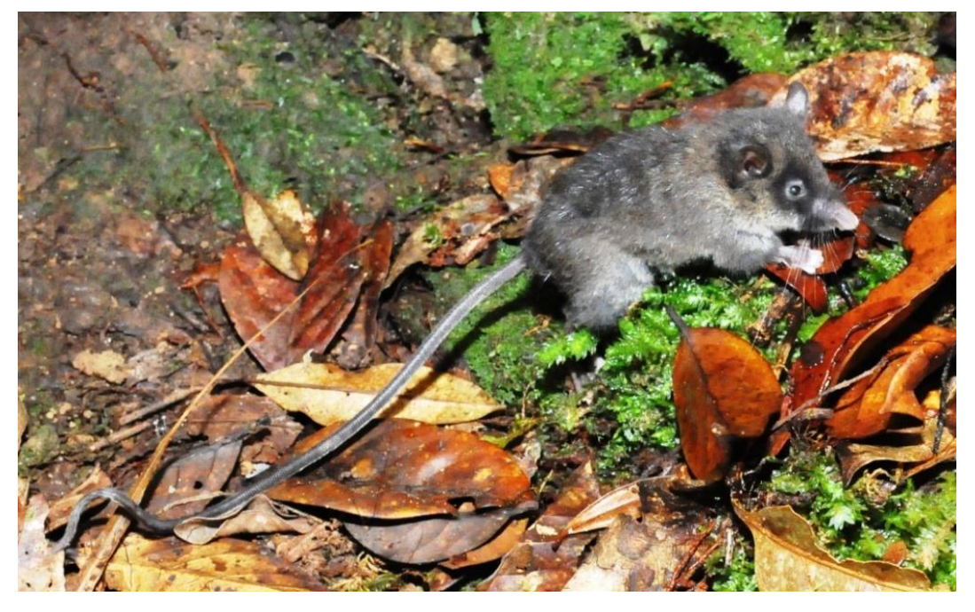
Figure 4. Sommer's Sulawesi shrew-rat, Sommeromys macrorhinos (MZB34758), from Gunung Gandangdewata.

We also recorded four additional sympatric shrew rats on Gn. Gandangdewata. We collected a single specimen of Paucidentomys vermidax at the 1600 m site (Esselstyn et al. 2012), 11 specimens of Tateomys macrocercus at the 1600 m (3 specimens) and 2600 m (8 specimens) sites, 16 specimens of T. rhinogradoides at the 2200 m (11 specimens) and 2600 m (5 specimens) sites, and four specimens of Melasmothrix naso at 2200 m (1 specimen) and 2600 m (3 specimens) sites. These results indicate that small mammal communities on Sulawesi can contain several co-occurring shrew rats.