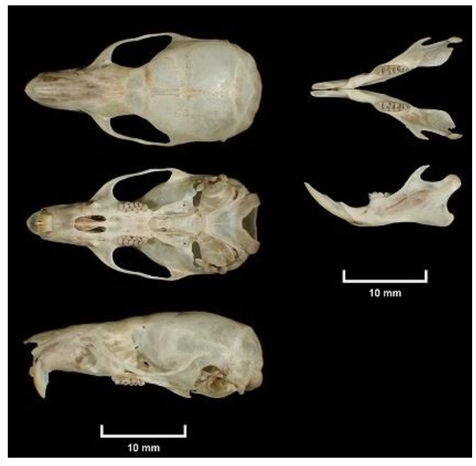
Figure 3. Crunomys celebensis, FMNH 219003.

These findings indicate that Sommeromys inhabits montane forest habitats that, at least in the Quarles range, extends to the transition between lowland and montane forest formations, and Crunomys is a lowland forest rat reaching the transitional zone but not extending higher into montane forest habitats.