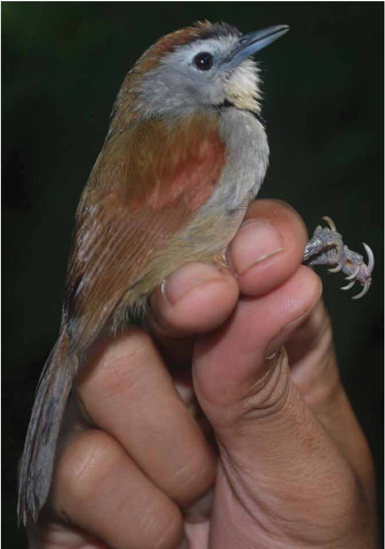
Figure 1. Crescent-chested Babbler Stachyris melanothorax