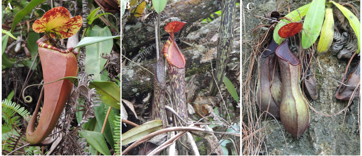
Fig. 1. A. Nepenthes sumatrana (Miq.) Beck ex Tamin & M.Hotta. B. Nepenthes spectabilis Danser. C. Nepenthes tobaica Danser; from North Sumatra Province, Indonesia.

Minolta SPAD-502 meter with the value used being the mean of three measurements per leaf.