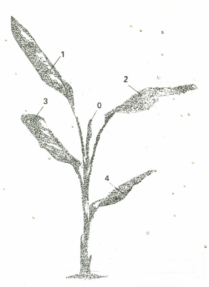
Figure 2. Numbering of leaves used to identify the position of leaves on stem.