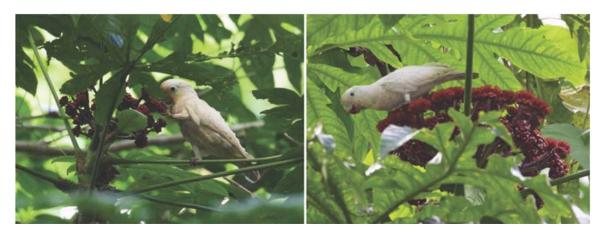
Figure 2. Goffin's cockatoo feeding on an Osmoxylon insidiator (local name: Mangmate Nglolan) in Lorulun forest (Camp 1).