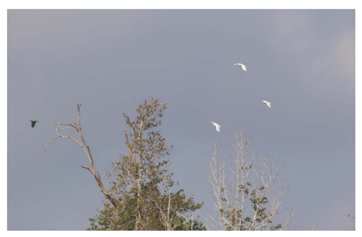
Figure 6. A group of three Goffin's cockatoos displacing and chasing a single male Eclectus parrot at the edge of the forest in Lorulun fields (Camp 2).