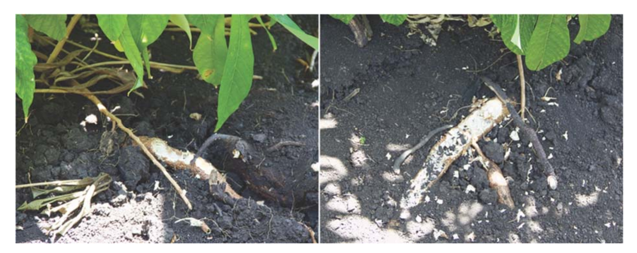
Figure 4. Excavated and eaten cassava roots in Lorulun fields (Camp 2).