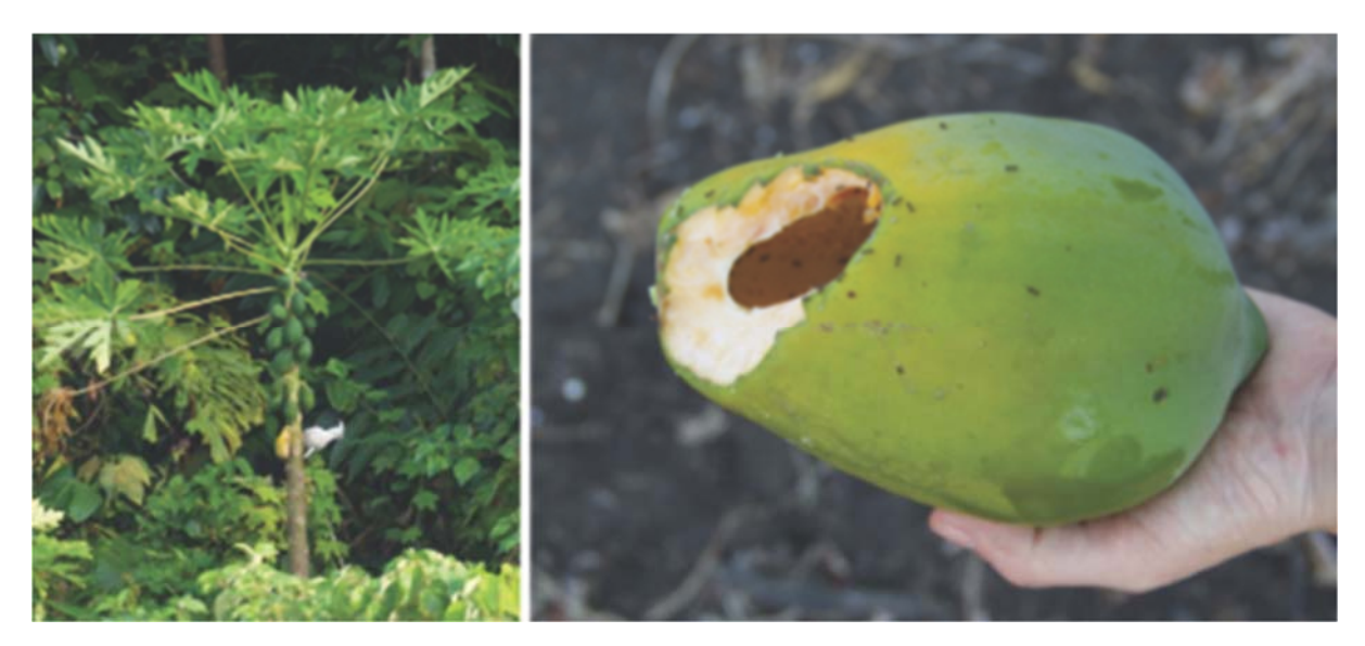
Figure 3. Foraging on papaya fruit ( Carica papaya ) in Lorulun fields (Camp 2). Left: Goffin's cockatoo approaching a ripe papaya fruit. Right: eaten papaya fruit.