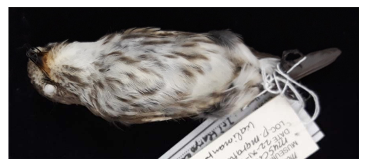
Figure 3 . Likely the first specimen of Gray-streaked Flycatcher ( Muscicapa griseisticta ) from Borneo, netted on Maratua Island in November 2017. The bold and distinct vertical streaking on the breast and long primary projection are diagnostic for this species.

Gray-streaked Flycatcher: We netted one individual, which is probably the first specimen (Fig. 3) from anywhere in Borneo. It was identified based on its heavy, distinct ventral streaking and very long primary projection (David Wells, pers. comm.,14 August 2018). This Boreal migrant typically winters from the Philippines to New Guinea.