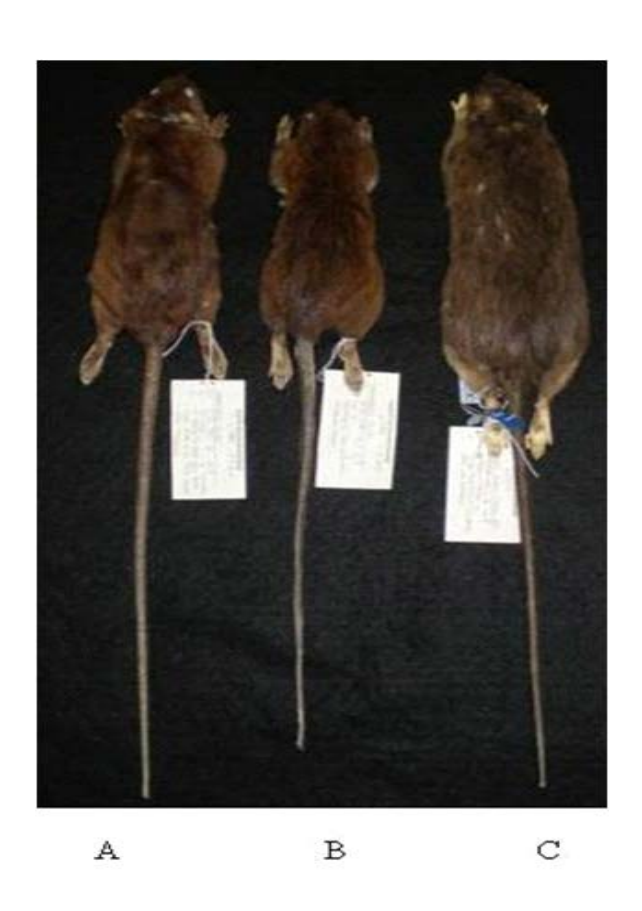
Figure 1b. View of skin of L. diwangkarai sp nov from Bukit baka West Kalimantan (A), Pemantang Central Kalimantan (B) and Cibodas West Jawa (C)